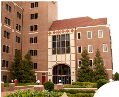
College of Social Work University Center, Building C

The FSU College of Social Work recruits one of the most diverse student cohorts on FSU's campus, giving each student the opportunity to learn from colleagues who bring invaluable professional experiences and life histories to the classrooms and field placements. Professors and students collaborate and embrace the robust conversations and intellectual adventures that cultural and social diversity bring.