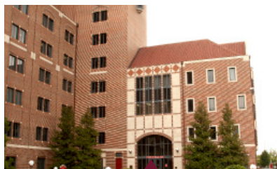
College of Social Work University Center, Building C

The FSU College of Social Work recruits one of the most diverse student cohorts on FSU's campus, giving each student the opportunity to learn from colleagues that bring invaluable professional experiences and life histories to the classrooms and field placements. Professors and students collaborate and embrace the robust conversations and intellectual adventures that cultural and social diversity bring.