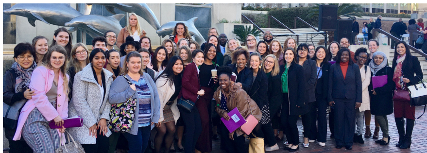
FSU social work students at NASW Legislative Education and Advocacy Day.