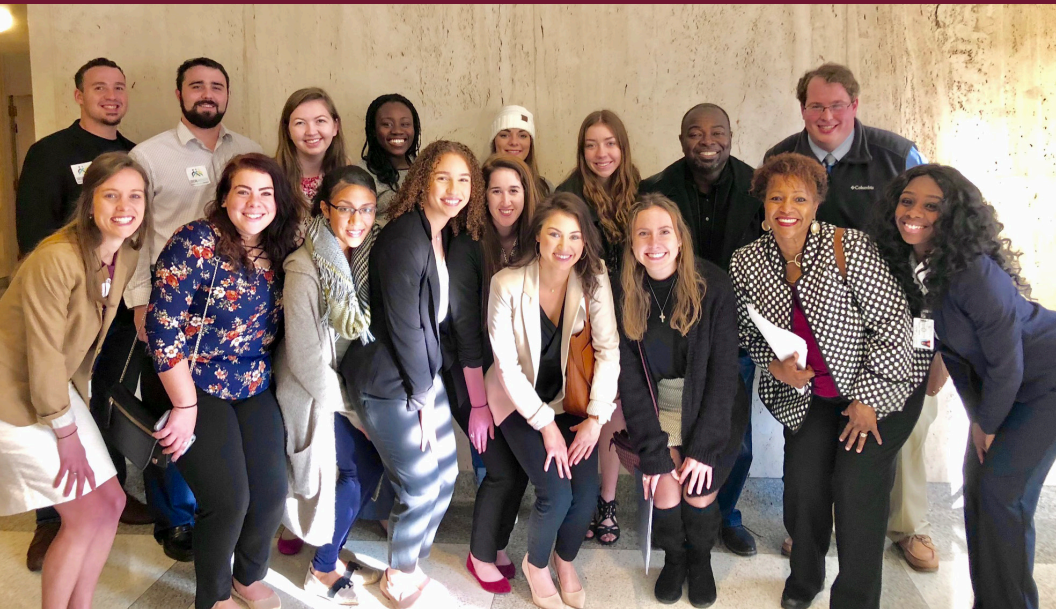
FSU Social Work faculty, staff and students advocating at the FSU Capitol.