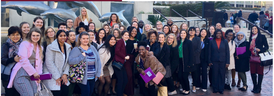
FSU social work students at NASW Legislative Education and Advocacy Day.