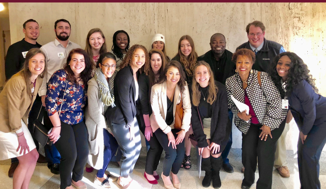
FSU Social Work faculty, staff and students advocating at the FSU Capitol.