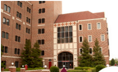
College of Social Work University Center, Building C

The FSU College of Social Work recruits one of the most diverse student cohorts on FSU's campus, giving each student the opportunity to learn from colleagues that bring invaluable professional experiences and life histories to the classrooms and field placements. Professors and students collaborate and embrace the robust conversations and intellectual adventures that cultural and social diversity bring.